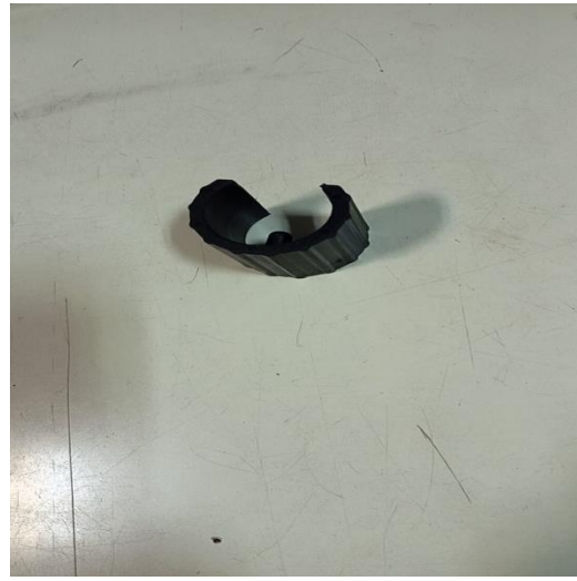
Product: Injection Mould (4 Cavities), Customer: M/s ALIMCO