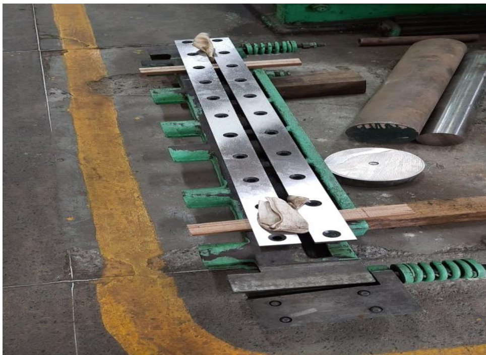
Product: Shearing Machine Blade, Customer: M/s. Variable Energy Cyclotron Centre (VECC), Kolkata