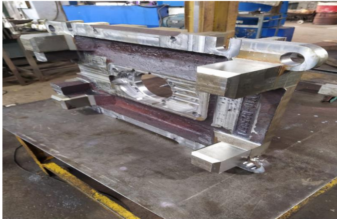
Product: Base Plate, Customer: M/s. Howrah Technical Services