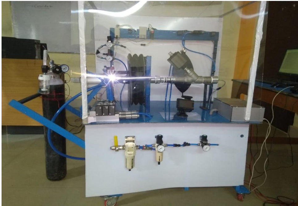
Product: Non-Invasive CPAP Ventilator Prototype