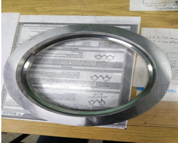
Product: Extrusion Dies, Customer: M/s. Indian Ordnance Factory, Katni